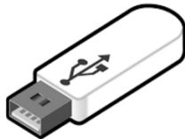
<USB Memory> Necessary