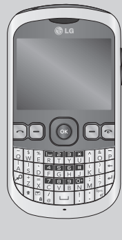
www.lg.com Bluetooth QD ID B016671