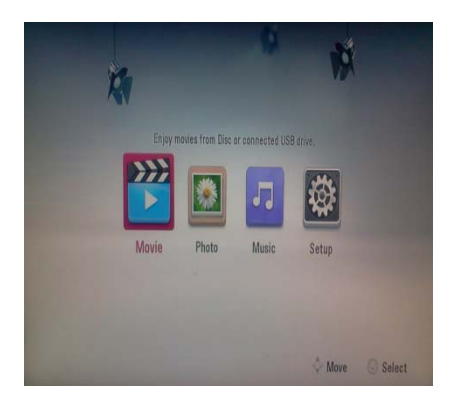
Step 2: Updating Firmware