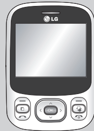
www.lg.com Bluetooth QD ID B016956

Some of the content of this manual may differ from your phone depending on the software of the phone or your service provider.